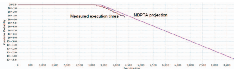
Fig. 2. pWCET estimates obtained with MBPTA for TVCA

gives the end user probabilistic guarantees that all potential mappings (and their impact on timing) are properly covered. For that purpose we implemented random replacement for IL1, DL1, ITLB and DTLB; and random modulo placement [5] for IL1 and DL1. In both cases we build on a pseudo-random number generator that has been shown to provide enough randomization for MBPTA [2].