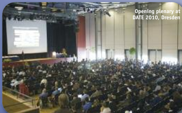
Opening plenary at DATE 2010, Dresden

The event is sponsored by the European Design and Automation Association, the EDA Consortium, the IEEE Computer Society – TTTC, the IEEE Council on EDA, ECSI, ACM - SIGDA, and RAS