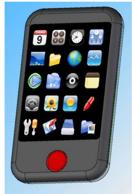
Fig. 1: PDA with SIRIUS-JANUS (Developed in ASIC Center HS-Offenburg)