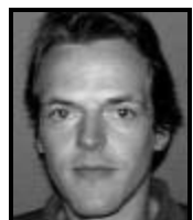
PROCEEDINGS AND WEB Diederik Verkest IMEC, Leuven, B